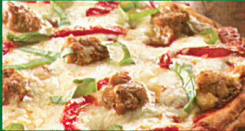
Chicken Sausage Topping 5601