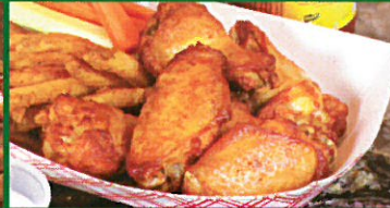
Buffalo-Style Wing 4604