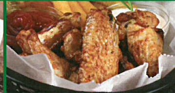
Oven Roasted Wing 4608