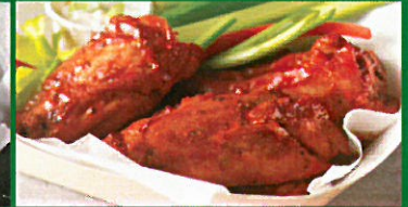
Thigh BoneZ™ 6705

Save more per case for every qualifying product purchased during the promotion period and save up to $7 per case!